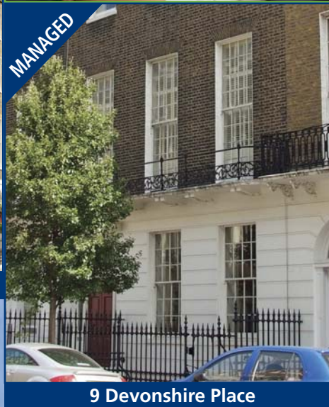
9 Devonshire Place