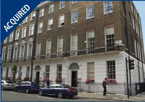
113/115 Harley Street