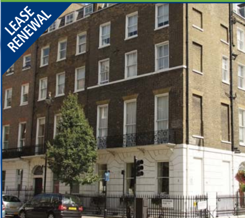
1 Devonshire Place