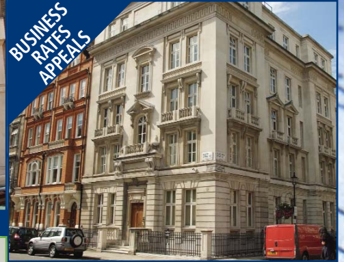
35 Harley Street