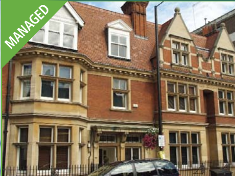
114A Harley Street